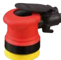
(131013 & 151015)