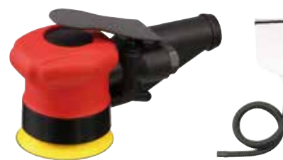
(Self-Generated Vacuum Type)