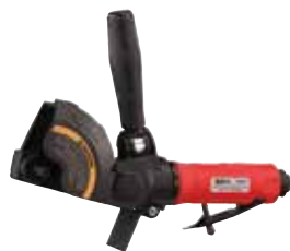
(Non Vacuum Type)