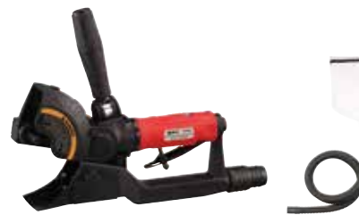
(Self-Generated Vacuum Type)