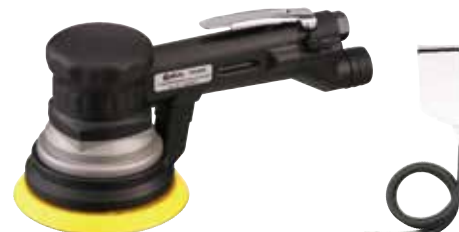
(Self-Generated Vacuum Type)