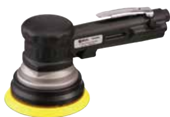
(Non Vacuum Type)