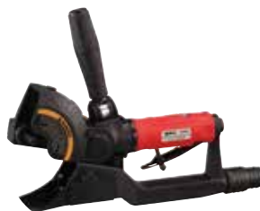
(Central Vacuum Type)