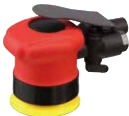
(Non Vacuum Type)