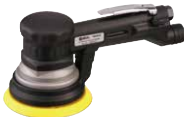
(Central Vacuum Type)