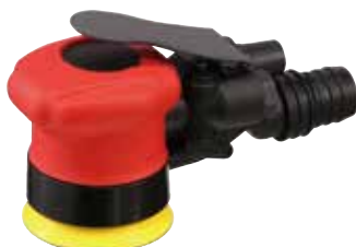
(Central Vacuum Type)